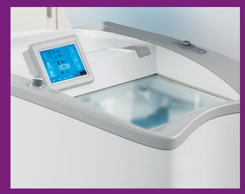
Optional cold disinfection system for NX50 and NX70 cryostats