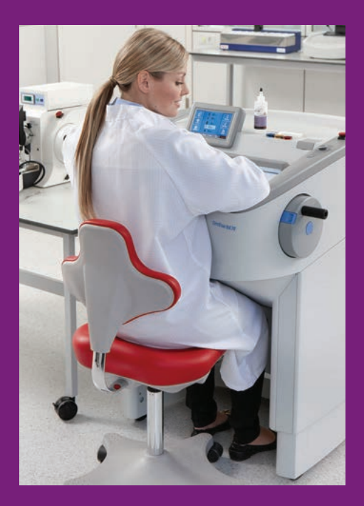
Motorized height adjustment for seated or standing operation (standard for NX70, optional for NX50 models)