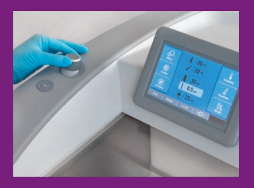
NX70 cryostats feature motorized sectioning for ease of use and to reduce the need for repetitive motions